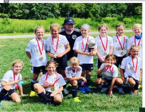
Legacy 2011 Girls STA Kickoff Tournament Champions