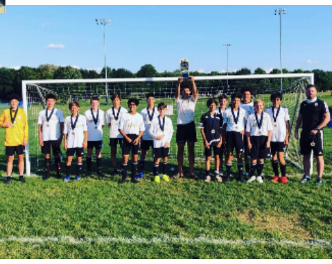
Legacy 2006 Boys Roxbury Kickoff Classic Champions

Legacy 2005 Girls Legacy 2004 Girls Black Legacy 2003 Girls Black Steel United Fall Showcase Champions