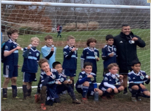
Berna 2011 Boys FC Berna Fall Finale Champions